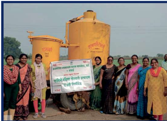
DAMINI WOMEN FARMERS PRODUCER COMPANY LTD. DEOLI